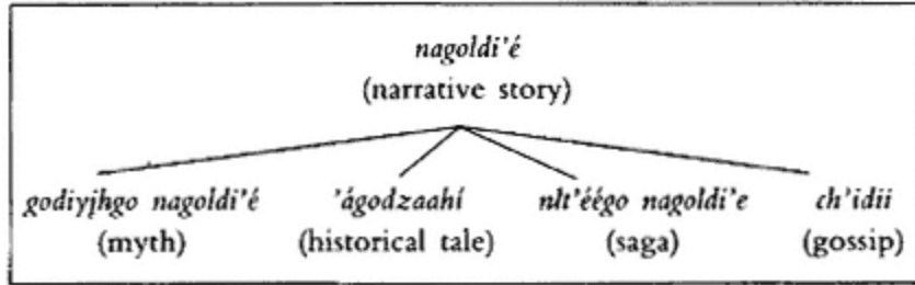
Figure 3 Major categories of Western Apache narrative.